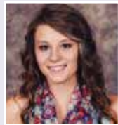
Dayna James Leonard & Doris Aerni Memorial; William & Emma Steffen Nursing